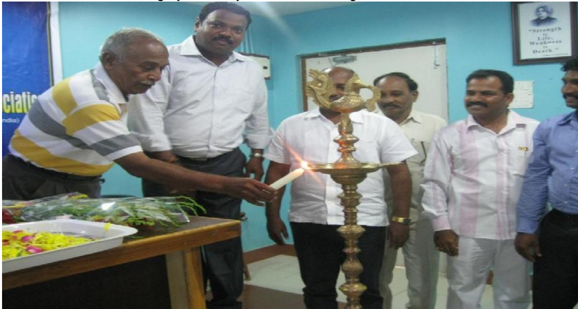
Youth Development centre:

In order to motivate positive leadership among the youth A camp was organized in which local youth leaders, intellectuals and Local people & students were invited. Youth have taken the oath for national Integrity and they also assured to generate the same in other Youths.